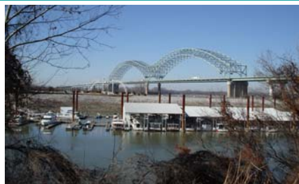
HEPACO begins work on the Hernando DeSoto Bridge over the Mississippi River.