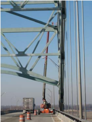
Two team members are lifted to the lowest point of the bridge truss.

HEPACO was requested by the Tennessee Department of Transportation, Professional Service Industries, Inc., and Modjeski and Masters to help develop and implement a plan to conduct a National Bridge Inventory inspection of all parts of the two main truss sections of the Hernando DeSoto Bridge on I-40 over the Mississippi River. The HEPACO work team’s role includes the field engineering and operation of suspension scaffolding for access, the removal of pigeon guano and other debris, and the priming and painting of the truss joints.