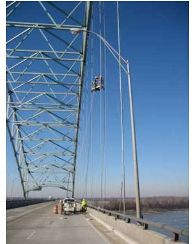
A work cage is lifted to an access point.

The bridge truss spans are approximately 180 linear feet from the deck at the highest points and approximately 100 linear feet from the deck to the river. The access requires the mounting of aluminum brackets that HEPACO had engineered and fabricated to support the work cages. Two members of the work team are lifted to the lowest point of the bridge truss utilizing a 135-foot hydraulic man-lift. They walk to the top of the bridge trusses to set the mounting brackets and other safety tag lines.